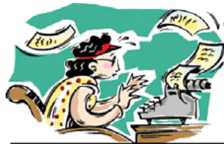
From the Editor

The monthly Bay Laker newsletter will be available in the clubhouse shortly after the first of each month through October. There are no home deliveries until November.