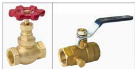
Gate Valve Ball Valve

There are two types of shut-off valves, as indicated in the photo. A “gate valve” looks like the thing a garden hose connects to, and a “ball valve” has a straight handle coming out of it.