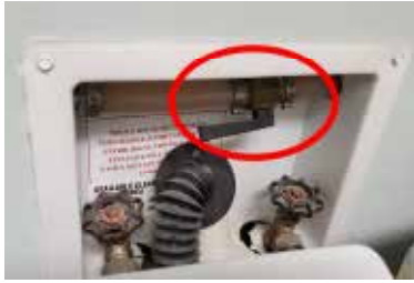
Palm Harbor Valve

provides unfettered access in an emergency. (See photo.)