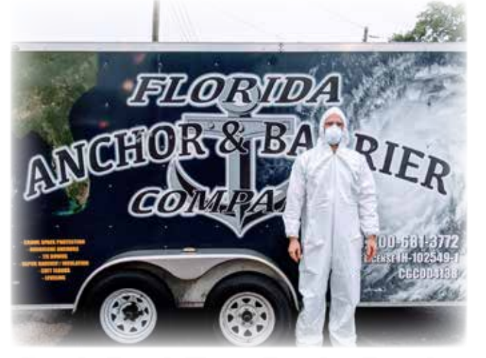
Insulation & Vapor Barrier Repairs Soft Floor Repairs & Laminate Flooring

Wishing you good health and safety, The Florida Anchor & Barrier Team