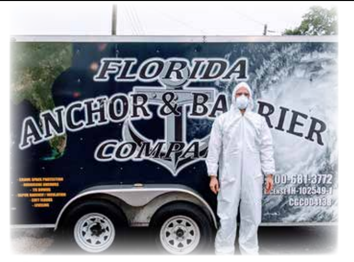
Insulation & Vapor Barrier Repairs Soft Floor Repairs & Laminate Flooring

Wishing you good health and safety, The Florida Anchor & Barrier Team