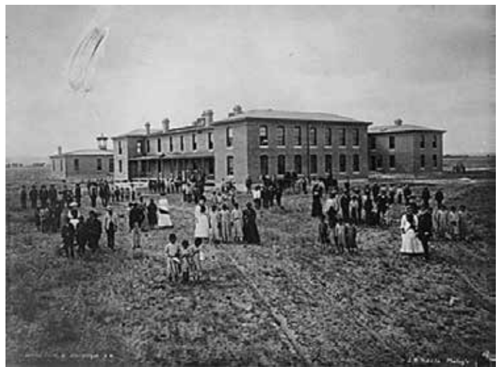
Indigenous Indian School in 1885