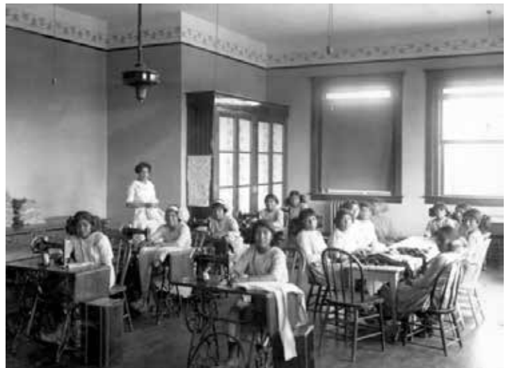
Indigenous children with sewing machines

If you have a "The Humane Thing To Do Story," you would like to share with BLE residents, kindly submit your story to Editor@BayLakeEstates.org . Please put in the subject line Newsletter and your preferred column placement. If you do not receive a reply from me that I received your article, please call me before the deadline.